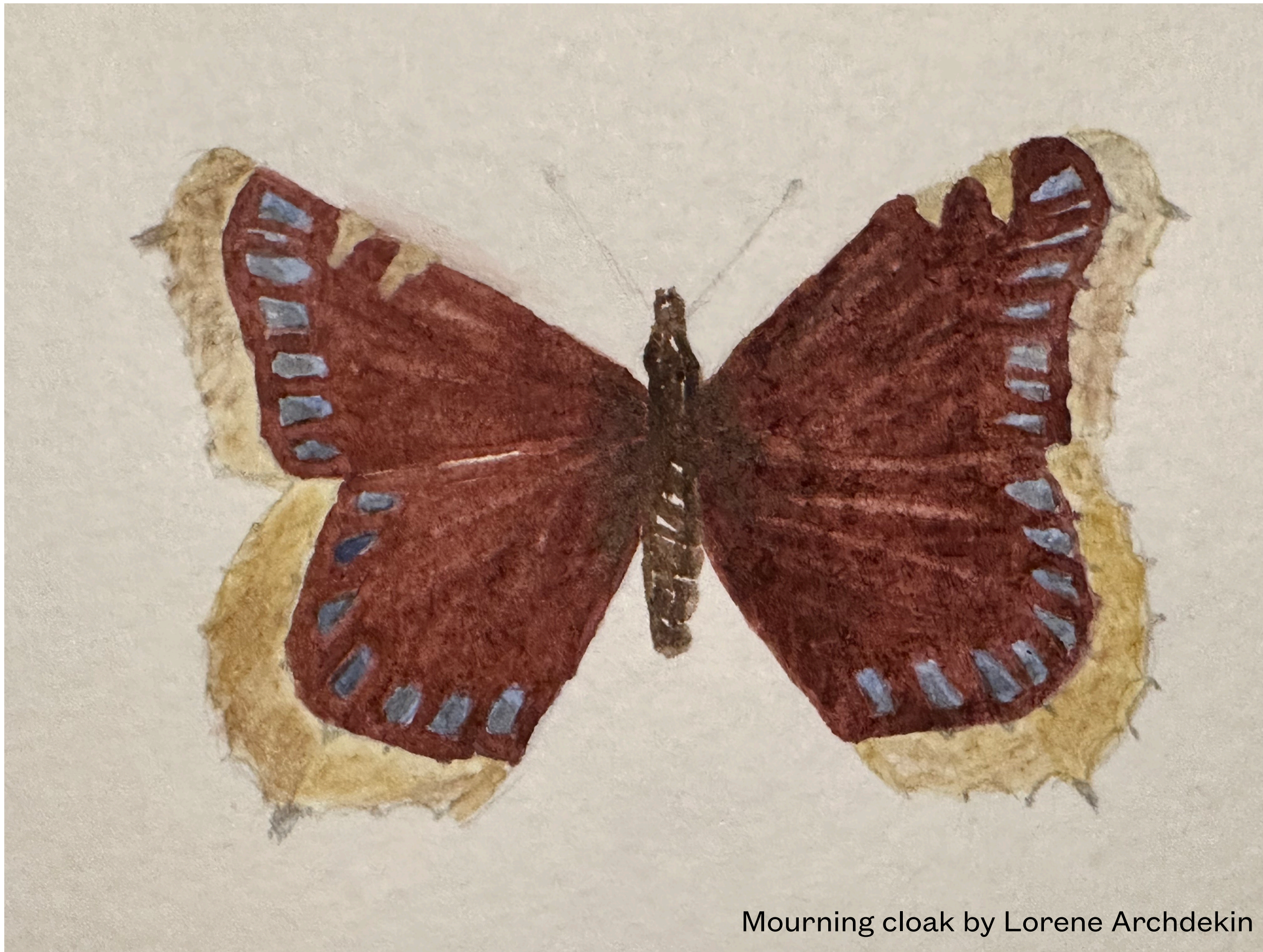
Mourning cloak by Lorene Archdekin