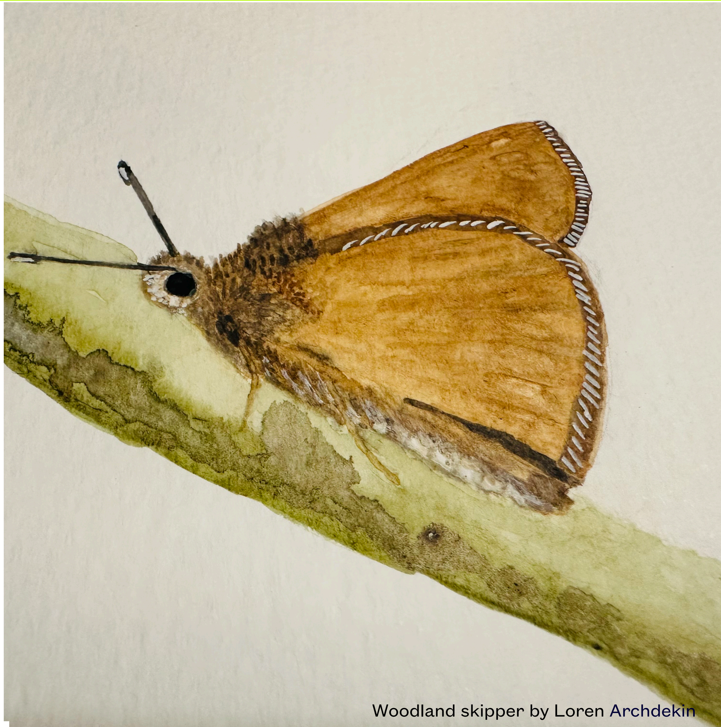
Woodland skipper by Loren Archdekin