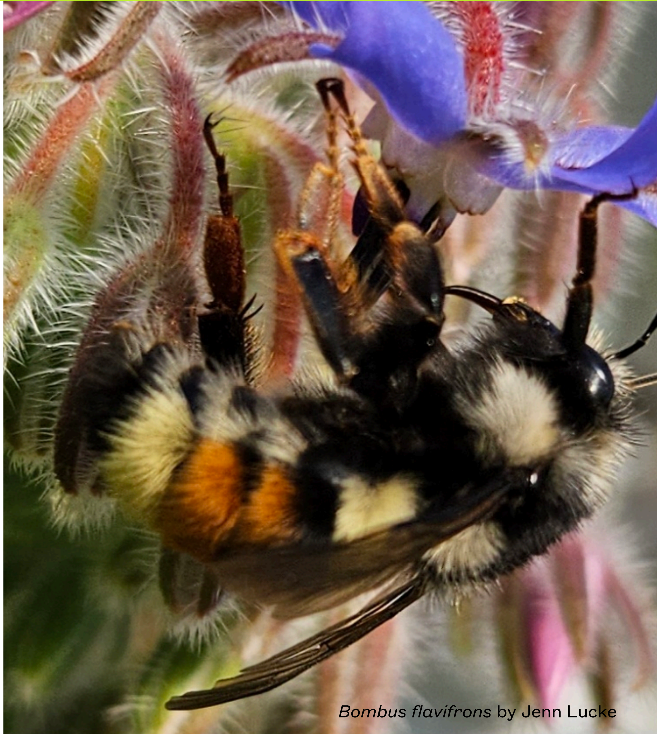
Bombus flavifrons by Jenn Lucke